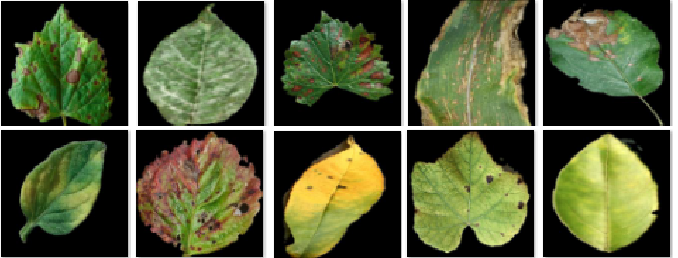
Fig. 1: Example of sample images of PlantVillage Dataset.